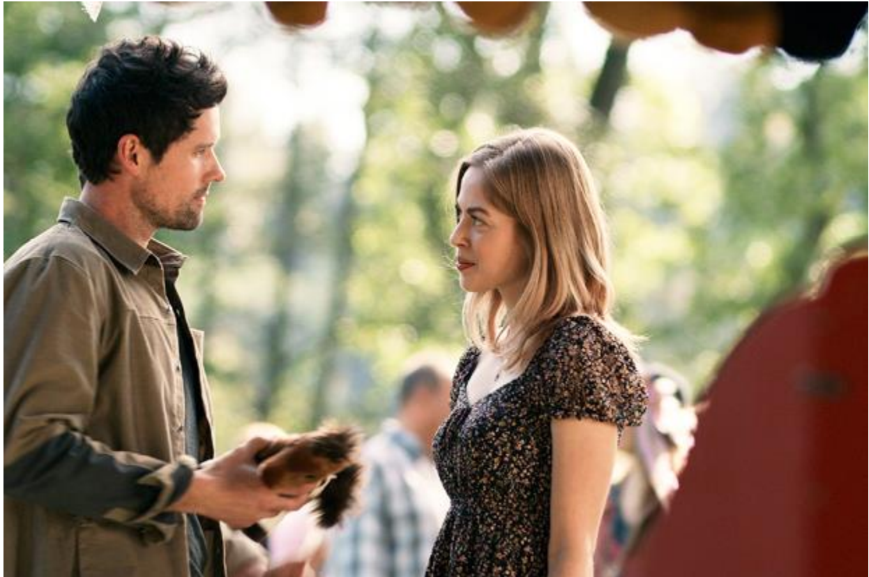
Lizzie is a new character in season 2.