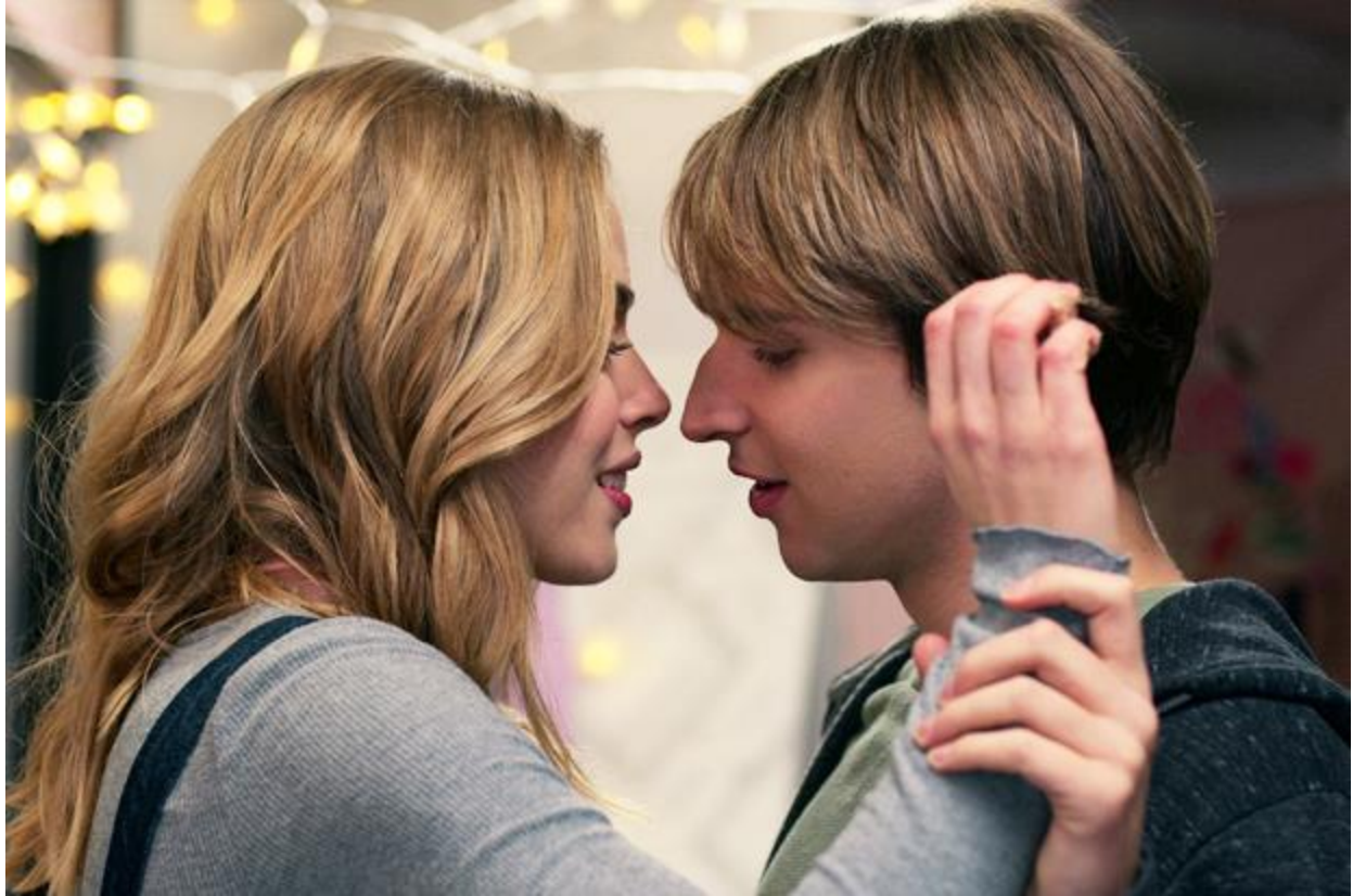
Lizzie and Ricky in season 2.